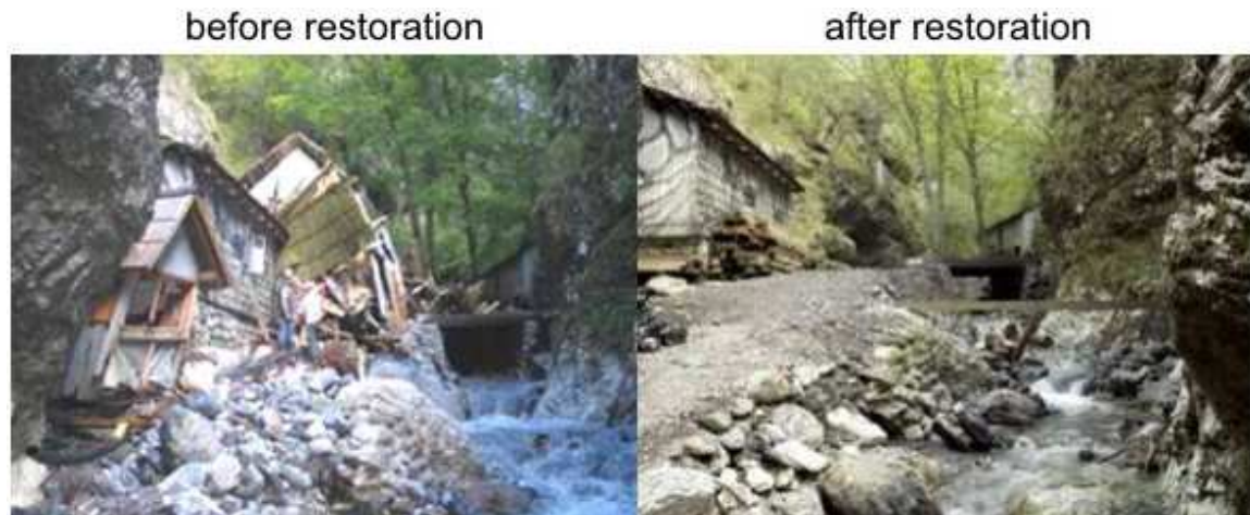
Figure 1.2. Before and after the restoration of the Franja Partisan Hospital